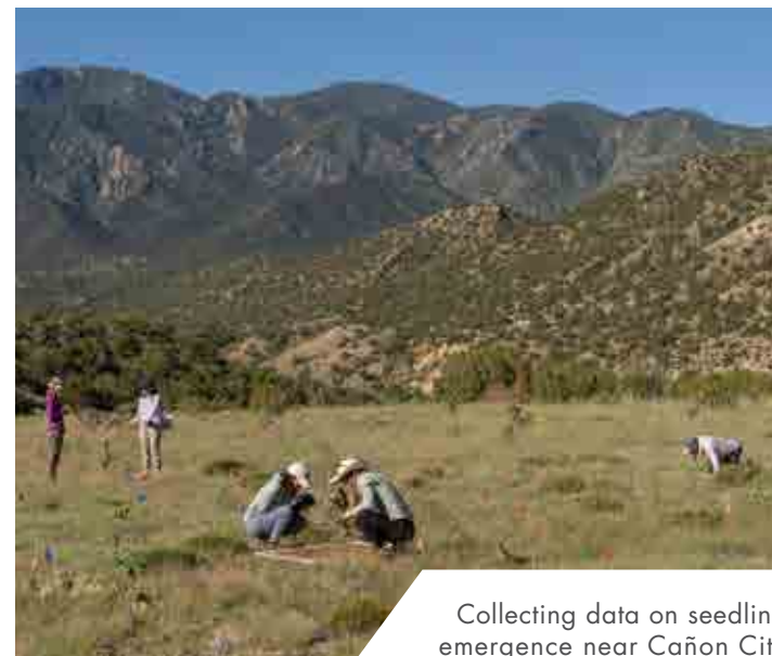
Collecting data on seedling emergence near Cañon City