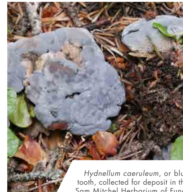
Hydnellum caeruleum , or blue tooth, collected for deposit in the Sam Mitchel Herbarium of Fungi

Every year we work with researchers and community scientists to collect hundreds of mushrooms for deposition in The Sam Mitchel Herbarium of Fungi. In 2023, volunteers and staff incorporated 860 fungal specimens. These include specimens from the Aspen Center for Environmental studies mushroom course, specimens collected as part of a collaborative grant-funded project in Kansas and Colorado, and specimens from the Telluride Mushroom Festival. In addition, we incorporated over 150 truffle specimens from a collection at Northern Arizona University. Continuously adding specimens such as these enriches our collections and enhances this important resource for future biodiversity research.