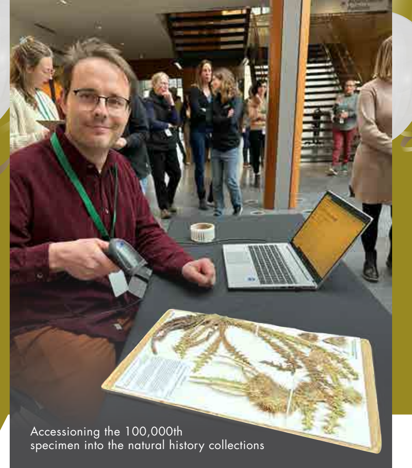
Accessioning the 100,000th specimen into the natural history collections

In 2023, we accessioned our 100,000th specimen into the natural history collections. Not just any specimen could fit the bill, so we chose the type collection of Cirsium funkiae , the funky thistle, for this great honor. We celebrated this momentous occasion with a gathering of staff and volunteers.