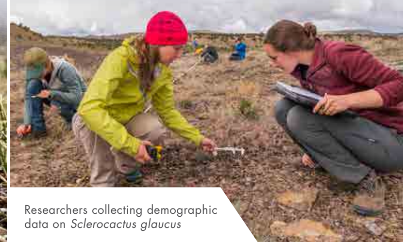
Researchers collecting demographic data on Sclerocactus glaucus

Through collaboration with the U.S. Bureau of Land Management and over a decade of studying population dynamics, Denver Botanic Gardens found that the federally listed cactus Sclerocactus glaucus (Colorado hookless cactus) is stable and resilient to both climate change and threats from energy development. These results led the U.S. Fish and Wildlife Service to recommend delisting, thus removing it from the list of threatened and endangered species under the Endangered Species Act. However, we will continue to monitor changes in population size and density, demographic response to the environment and seed dispersal. Combined, these analyses will prepare us to detect population declines in time to take appropriate conservation actions if needed.