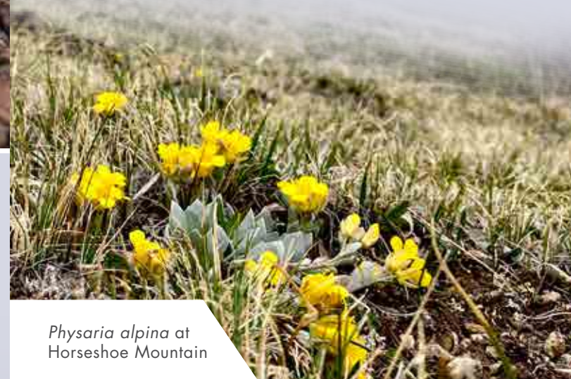
Physaria alpina at Horseshoe Mountain

Rare alpine plants are some of the most at-risk species from climate change. Little information is known about how alpine endemics will respond to increases in temperature, reduction in snowpack and length of growing season, among other environmental factors. One such species that needs more research is Physaria alpina (Avery Peak twinpod), found only in high alpine areas of the central Colorado mountains. In 2023, we set up a long-term demography project at Horseshoe Mountain to understand how growth, reproduction and community composition will change over time in the species' natural habitat. This research will help inform future conservation action.