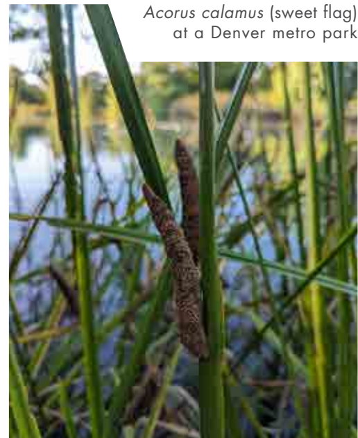
Acorus calamus (sweet flag) at a Denver metro park

You might not think there are many native or rare plants to document in the city of Denver. However, thanks to numerous green spaces and parks, the greater metro area harbors many plant species. This summer, our excursions throughout Denver yielded collections of over 100 unique plants. One of the most memorable we found was Acorus calamus , or sweet flag. Only known from a handful of locations along the Front Range, we were able to document five new occurrences. These new distributions will provide valuable information for tracking this rare species.