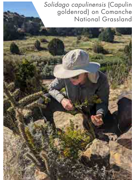
Solidago capulinensis (Capulin goldenrod) on Comanche National Grassland

In collaboration with the Botanic Gardens Conservation International and the U.S. Forest Service, we traveled to the southeastern corner of the state to search for the rare Solidago capulinensis (Capulin goldenrod). Currently only known from one location on Comanche National Grassland, our goal was to find additional populations and then return to collect seed for conservation and revegetation. However, after an exhaustive search, we only found a single plant, from the same population that was documented in 1949. Although we only found one Capulin goldenrod, we were able to make collections of 10 plant species not previously housed in our herbarium.