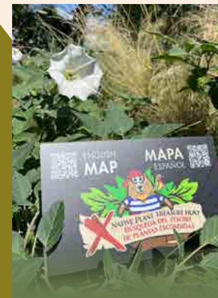
One of the plants you can find on the Native Plant Treasure Hunt

This year we provided several outreach opportunities for the community. We led hikes and volunteer outings and gave more than 50 herbarium tours. Through our monthly EcoQuests, we shared identification tips for plants and fungi and called on community members to post their findings on iNaturalist. During the City Nature Challenge, a global challenge between cities to record biodiversity and engage the community with nature, we coordinated participation efforts in the Denver-Boulder metro area. We even established the Native Plant Treasure Hunt, an ongoing pirate-themed scavenger hunt throughout the Gardens.