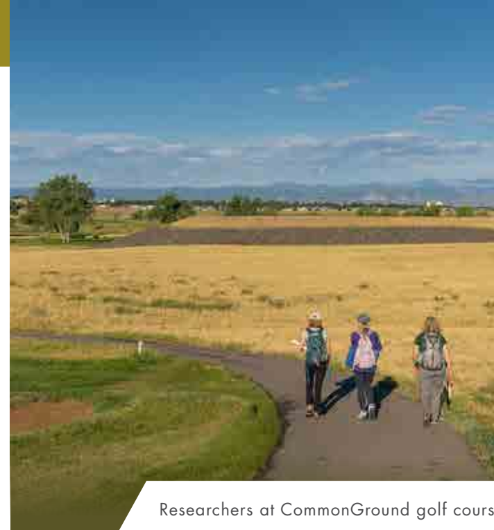
Researchers at CommonGround golf course