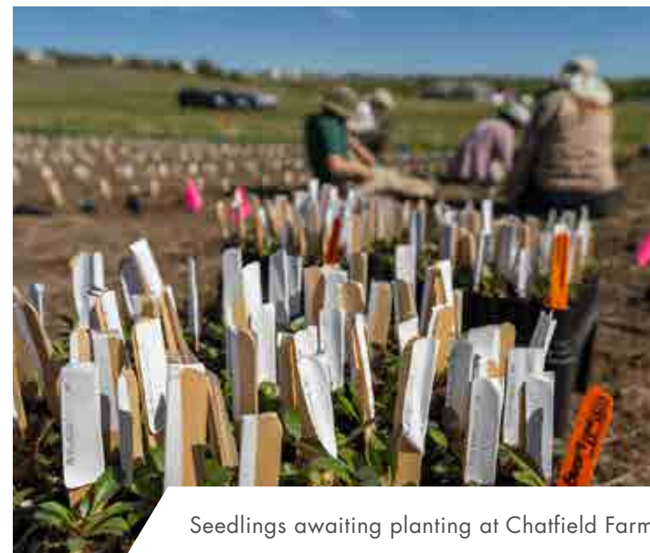
Seedlings awaiting planting at Chatfield Farms