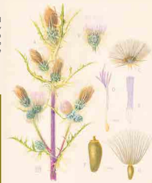
Illustration of Cirsium tukuhnikivatizicum from the School of Botanical Art and Illustration at Denver Botanic Gardens

Recent research revealed an undescribed species of thistle endemic to the La Sal Mountains of Utah, Cirsium tukuhnikivatizicum , or the La Sal thistle. This newly described species was named for Mount Tukuhnikivatiz, part of the La Sal Mountain range and a prominent backdrop for the La Sal thistle. Tukuhnikivatiz is also the Ute word for "where the sun sets last," and thus the name also pays tribute to the legacy of use of the La Sal Mountains by Indigenous people.