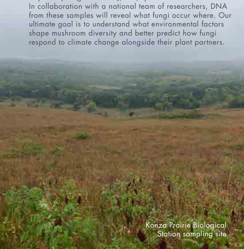
Konza Prairie Biological Station sampling site

Mushrooms are intimately associated with plants. Our National Science Foundation supported project attempts to understand mushroom-plant relationships by looking for fungi in grassland, oak and conifer forest habitats. This summer, we traveled to Niwot Ridge in Colorado and the Konza Prairie Biological Station in Kansas to collect samples of plants (living and dead), soil, spores and mushrooms. In collaboration with a national team of researchers, DNA from these samples will reveal what fungi occur where. Our ultimate goal is to understand what environmental factors shape mushroom diversity and better predict how fungi respond to climate change alongside their plant partners.