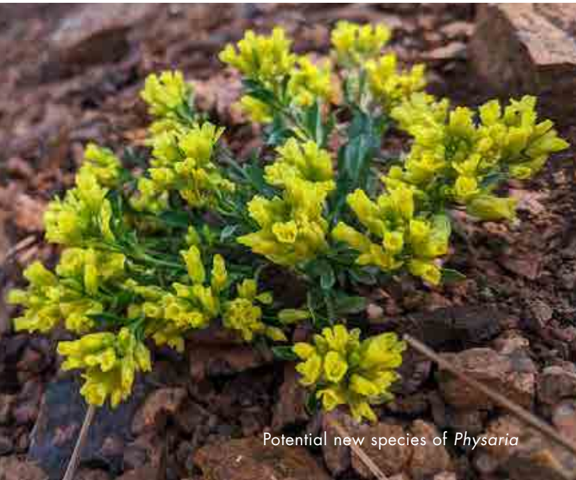
Potential new species of Physaria

One taxon of conservation concern in the Denver foothills is referred to as Physaria X1, hypothesized to be a hybrid between the rare Physaria bellii (Bell's twinpod) and more widespread P. vitulifera (fiddleleaf twinpod). We collaborated with researchers and government and nonprofit agencies to determine if Physaria X1 deserves species recognition. Our results showed that Physaria X1 was not a unique species, but a phenotypically unusual P. vitulifera . Surprisingly though, one population of P. vitulifera was shown to be quite genetically and morphologically distinct. Our next step is to use additional samples to determine if this population represents an undescribed species.