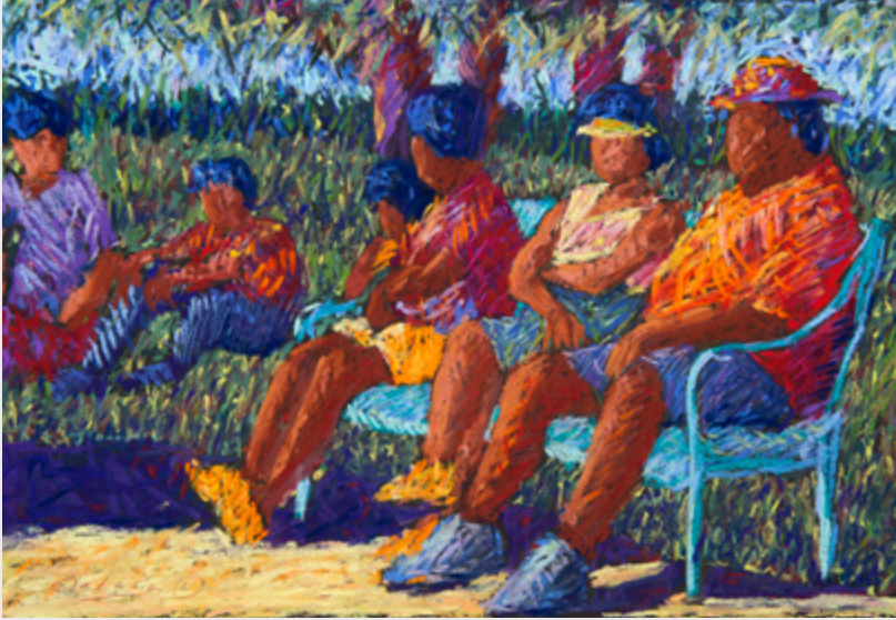
Tony Ortega, Los Trabajadores , 2019. Artwork © Tony Ortega.